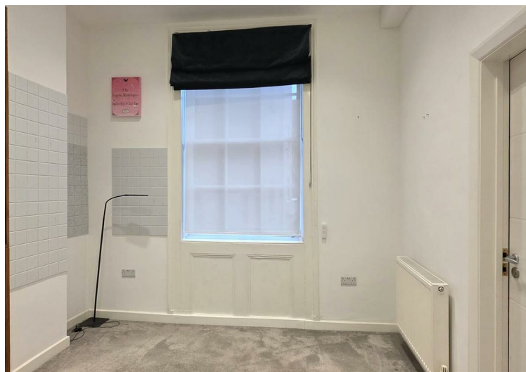
Bristol Gardens, Little Venice W9 £20,000 Per Annum Not specified